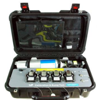
CaliCase Docking Station