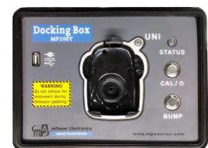
UNI Docking Box